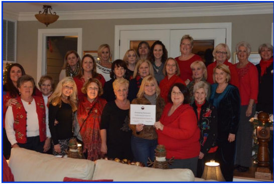
GFWC International Award Winners for Creative Fundraising